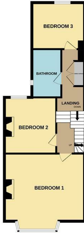
1ST FLOOR 612 sq.ft. (56.8 sq.m.) approx.